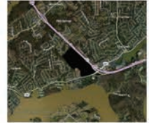
VICINITY MAP SCALE: NTS